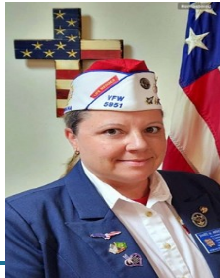
Jr. Vice Commander

I look forward to seeing each of you during my travels to the District meetings and at Convention in June